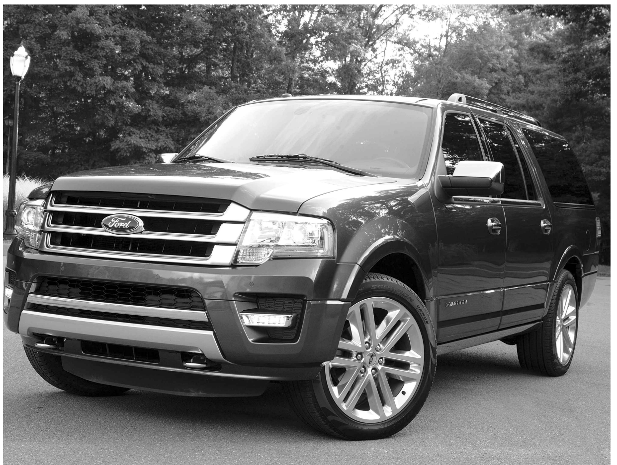
The 2015 Ford Expedition earned a five-star Overall Vehicle Score from the National Highway Traffic Safety Administration, the U.S. government's highest possible overall rating.